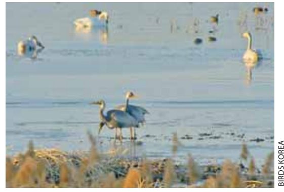
Plate 4 . White-naped Crane Grus vipio and other waterbirds in Joonam wetlands on the Nakdong River, winter 2008.

By the time of seawall closure in 2006, however, pamphlets (some now bilingual) instead depicted the soon-to-be-created land and reclamation lake as a green and blue paradise, with tropical corals below the water and waterfowl in the skies above a far cry from the cracked mud and polluted water of the actual reclamation site. Today the major use of the Saemangeum site will be industrial, something that could have been foreseen in the 1990s, and yet