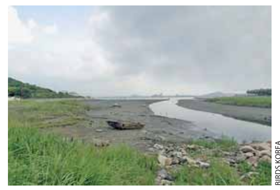
Plate 7 . The Mokpo Namhang urban wetland on the Yeongsan estuary is scheduled for development as an urban park with ornamental lakes, August 2008.

In March 2009, only five months after the promise of Ramsar Resolution X.22, the large-scale reclamation of the last remaining area of internationally important tidal flat at Song Do in Incheon was approved (Birds Korea 2009). The threatened tidal flat supports 13 species of waterbirds in Ramsar-defined internationally important concentrations. Since then the ROK government has announced the construction of the 'Song Do Global University Campus' at the Incheon Free Economic Zone-in a bid to build an educational hub for north-east Asia-on verv recently reclaimed land in Song Do 'Eco-city' (Danney 2010). In 2010 up to 20 US-based universities have been in talks, apparently to receive funds from the ROK to establish overseas campuses at the site. Song Do 'Eco-city' is Korea's largest foreign real estate development project and is being developed by Gale International, a large privately owned real estate development based in New York, in association with other high-profile American companies.