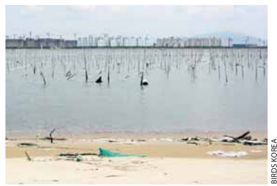
Plate 6 . The Nakdong estuary showing the encroaching urban development, May 2008.

The reclamation at Saemangeum and elsewhere in the Yellow Sea has already resulted in massive and measurable declines in a broad range of shorebirds species, especially long-distance migrants (Gosbell & Clemens 2006, Moores et al. 2008). The Saemangeum Shorebird Monitoring Programme (conducted by Birds Korea and the Australasian Wader Studies Group) confirmed the prediction that the massive loss of habitat at Saemangeum contributed to the rapid decline of the now Critically Endangered Spoon-billed Sandpiper, and the loss of 20% of the world's Great Knot population. Whilst this has largely been ignored by reclamation proponents, the prolonged criticism of the Saemangeum reclamation did have results. The ROK formally accepted that 'intertidal mudflats should be preserved and that no large-scale reclamation projects are now being approved in the ROK' (Ramsar Resolution X.22). The nation also elected to host a number of international environmental conferences and to develop further the national 'ecoinfrastructure'. Ironically, it probably even influenced the new 'Green New Deal' strategy, and especially the branding of Song Do and the FMRRP.