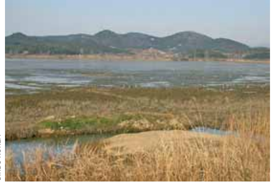
Plate 1 . Upo Ramsar site: a floodplain wetland on the Nakdong River under threat, March 2004.

placing heavy emphasis of the perceived benefits to the community. A camouflage of 'green credentials' or 'green-wrapping' is used by publicity and public relations teams to soften domestic concerns and to help attract overseas investment. This article reviews the four huge ROK projects noted above and the way they are presented to the Korean public and the international community.