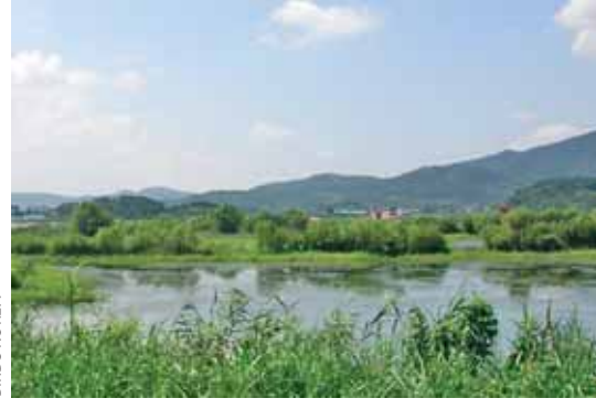
Plate 5 . Undisturbed habitat in Joonam wetlands on the Nakdong River in July 2008.

the marketing publicity continues to sell the reclamation as an eco-friendly project, creating wetlands and eco-parks, all deserving of direct overseas investment. 'We are planning to actively attract natural energy-related companies such as hybrids, fuel cells, wind power, solar energy and green resources; and auto parts, machinery, shipbuilding and other parts & material companies to the free economic zone' said Lee Choon-hee, commissioner of the Saemangeum Gunsan Free Economic Zone Authority (SGFEZ) (Lee 2009). Recent announcements confirm that this approach has convinced at least some overseas investors and media, undermining calls for the restoration of tidalflow at Saemangeum and possibly stimulating plans for reclamation projects in the ROK and neighbouring countries.