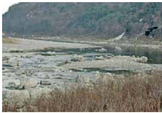
Plate 3 . Small rivers used by Scaly-sided Merganser Mergus squamatus in winter are under threat from planned 'improved utilisation' of small waterways, south Gyeongsang province, January 2009.

increased disturbance and reduced opportunity for the restoration of estuaries. As no comprehensive waterbird monitoring programme is in place, the report is based largely on data from the annual oneday Ministry of Environment Winter Bird Census (MOE Census), in addition to an extensive literature review. The MOE Census covers more than 140 sites, of which 48 are likely to be affected by phase one of the FMRRP, and Birds Korea believes that, if treated with due caution, data from these 48 sites can provide useful insight into the species and numbers of waterbirds likely to be most affected, and will enable some of the impacts of the project to be monitored with a degree of confidence.